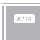
Locker Door Number Plates