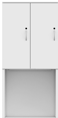
Locker Garage – 2 Pack 32" w x 24" D x 65-7/8" H