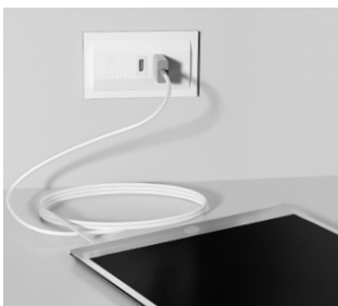
Optional low-voltage charging