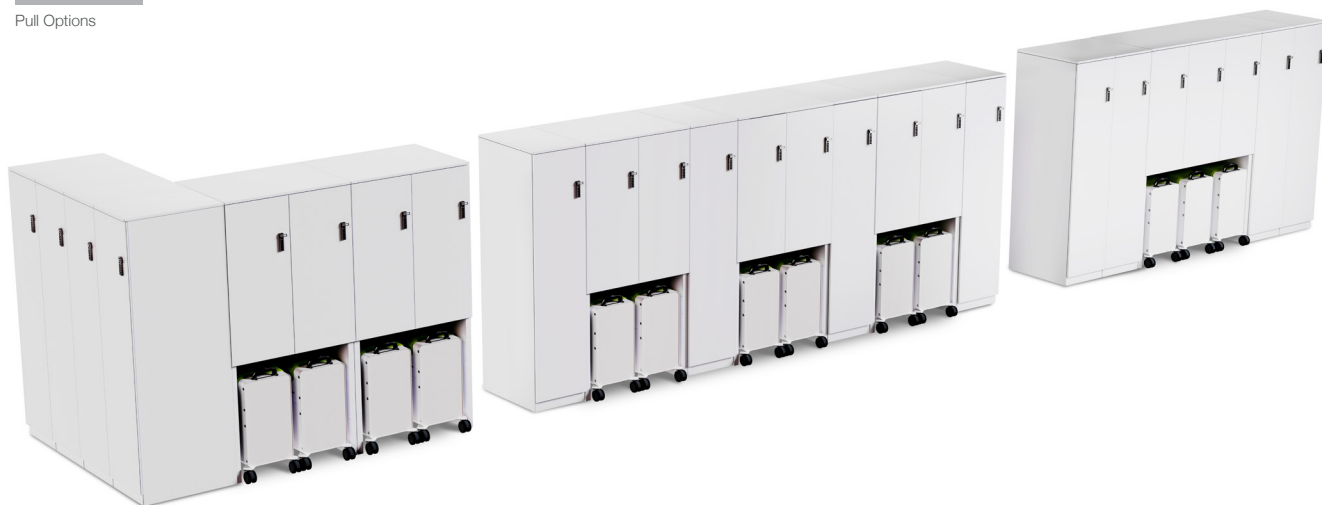
Locker Garage aligns with Trace Single Lockers