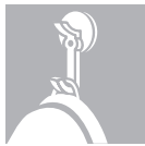
2-Prong Coat Hooks