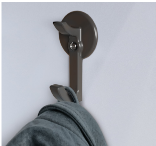
2-pronged coat hooks

Locker Garage is available in two or three pack configurations and can be ganged to create longer runs.