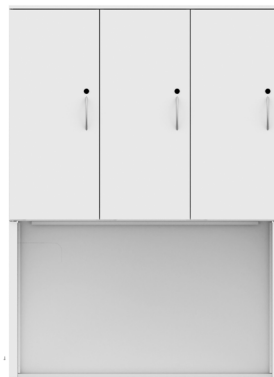
Locker Garage – 3 Pack 48" w x 24" D x 65-7/8" H