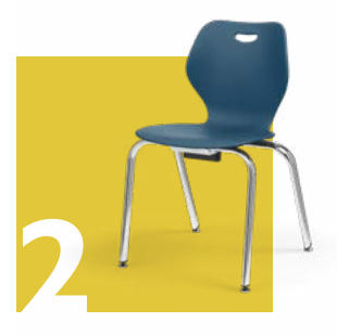
Intellect Wave® Collection