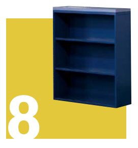
700 Series® Bookcases