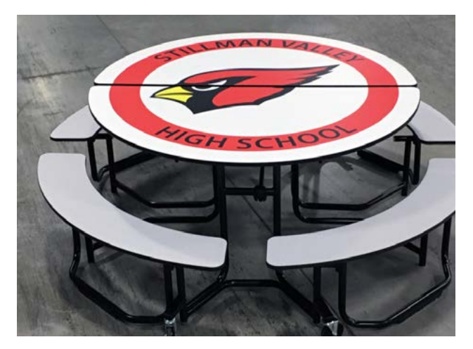
Bring your brand to life with school-specific graphics and colors.