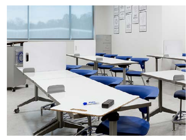
Design custom furniture or accessories such as this table stand which allows students to easily toggle between private testing and open collaboration by inserting or removing markerboard dividers.