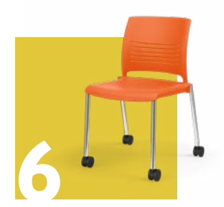
Strive® Seating Collection