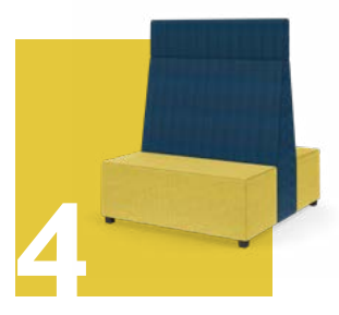
MyPlace<sup>™</sup> Lounge Furniture