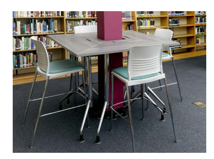
Address architectural issues and maximize the usable square footage of a space by designing custom table cutouts to wrap a column.

From computer labs to virtual gaming, we've seen unlimited innovations that enhance the learning experience. Sometimes these advances require modified or co-created furniture solutions to support. Infinity from KI is a proven way for KI to engage with you when standard furniture doesn't fulfill your needs. From custom materials and sizes to custom furniture designs, the Infinity from KI process can help provide students with the environment they need wherever learning takes place.