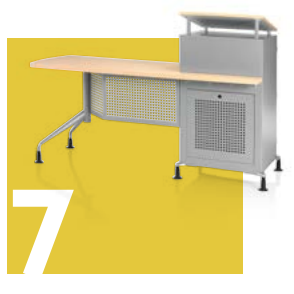
Instruct® Teacher Desk